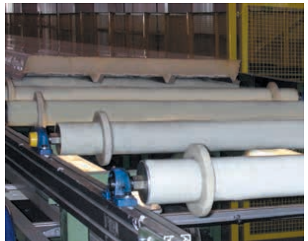
Non-marking surface protects products